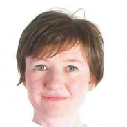
E. ENGLISH (UK)