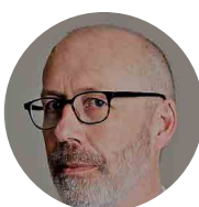
I. YOUNG (UK)